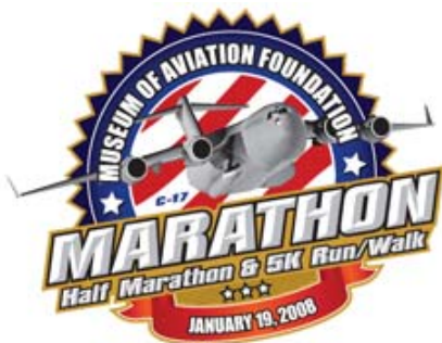
1/19/08 Museum of Aviation Foundation Marathon

Bandera is a trail run in the rugged Texas Hill Country State Natural Area. I decided to take the 50K "jump jumper" option instead of doing 100K.