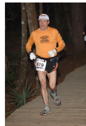
2/4/08 Rocky Raccoon 50 mile

The Museum of Aviation Foundation Marathon is on Robbins AFB in Georgia. With temps in the low 40's & a steady rain, I was in a hurry to get thru with it; I beat my time in Houston by 11 minutes.