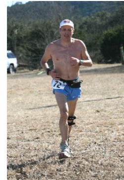
1/5/08 Bandera 50K

Thanks to fifty-six generous souls, I raised a total of $3,141 for AFH! Proceeds from this effort will be dedicated to helping improve the quality of life for individuals and families affected by the HIV/AIDS.