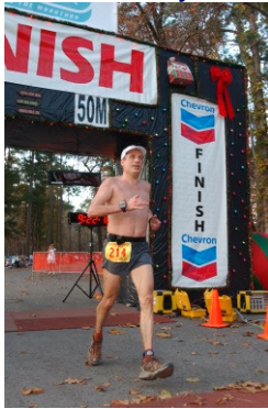
12/8/07 Sunmart 50 mile

After I finished my 100 th race of marathon length or greater in November, I decided to celebrate by raising funds for AIDS Foundation Houston in association with running the Chevron Houston Marathon in January.